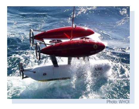
WHOI's Autonomous Underwater Vehicle, the Autonomous Benthic Explorer being deployed