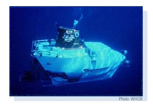
The Alvin underwater