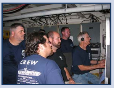
Researchers look on as the ROV sends images from the ocean floor.