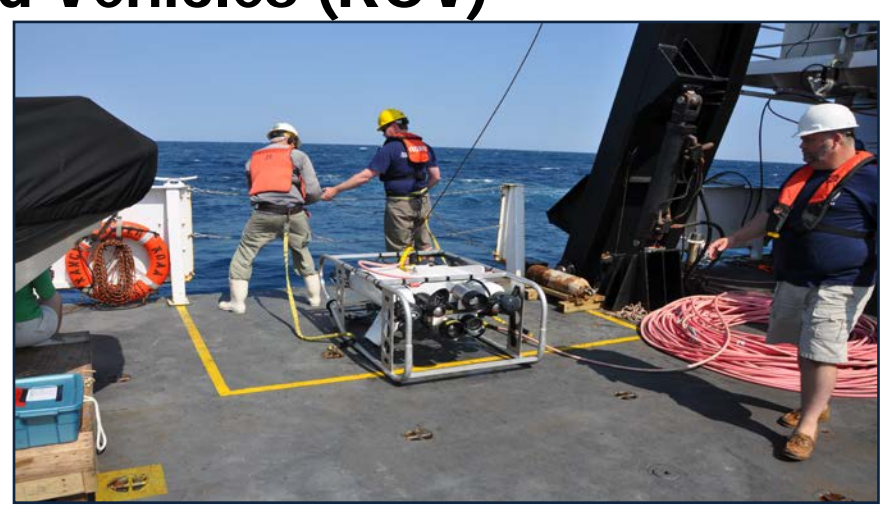
Maritime archaeologists deploy an ROV from NOAA Ship Nancy Foster.

NOAA Commissioned Corps Officers are an integral part of NOAA. Officers can be found operating one of NOAA's 19 ships or 12 aircraft to provide support to meet NOAA's missions. Duties and areas of operations can range from launching a weather balloon at the South Pole, to conducting fishery surveys in Alaska. Find out more about the Corps, its mission, and history at http://www.noaacorps.noaa.gov/