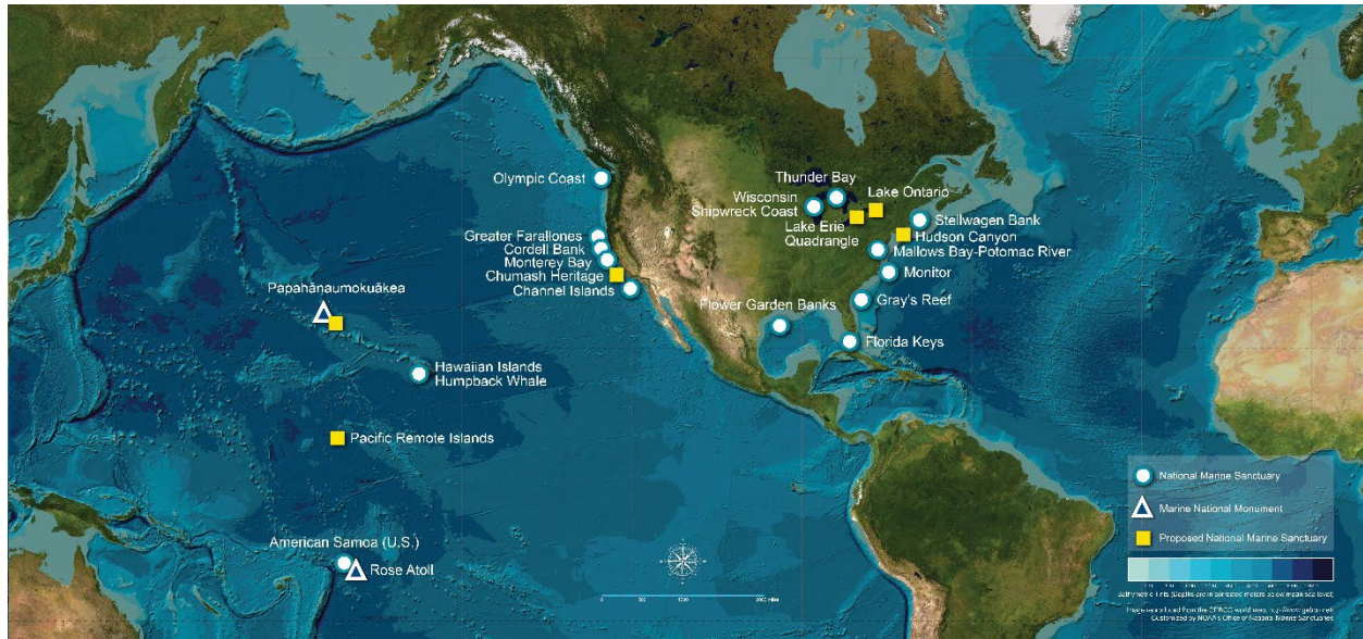
The National Marine Sanctuary System is a network of underwater parks encompassing more than 620,000 square miles of marine and Great Lakes waters. The network includes 15 national marine sanctuaries and two marine national monuments.