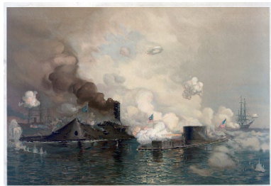
Battle of the Ironclads, J.O. Davidson