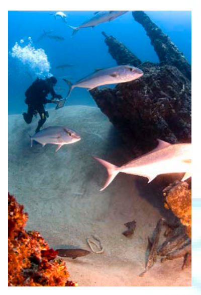
German U-boat, U-701, off the North Carolina coast