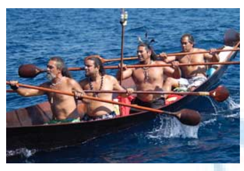
Chumash paddlers crossing the channel in traditional Tomol canoe