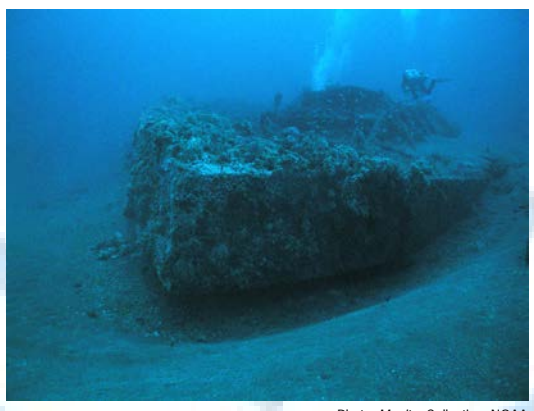
The USS Monitor shipwreck located 16 miles off Cape Hatteras, N.C., at a depth of 240 feet, is now home to an abundance of sea life.