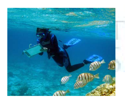
Diver conducting a fish count on a shipwreck