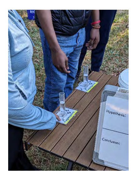
Water quality station during B-WET program.