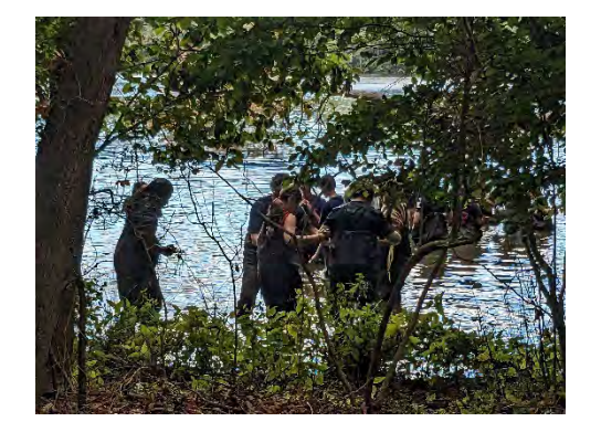
Planting station during B-WET program.