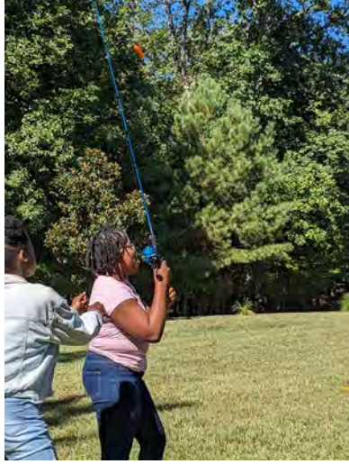
Fishing station during B-WET program.