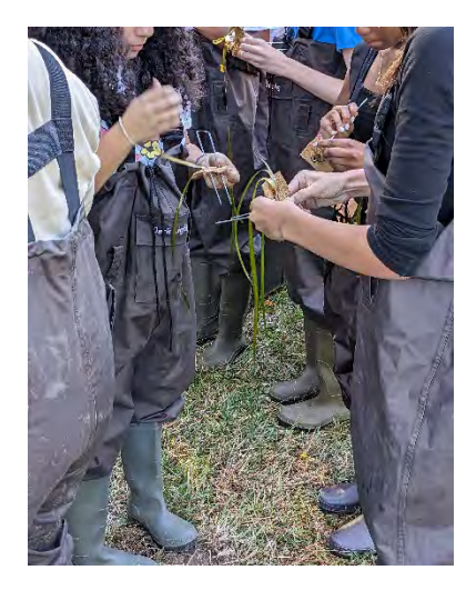
Planting station during B-WET program.